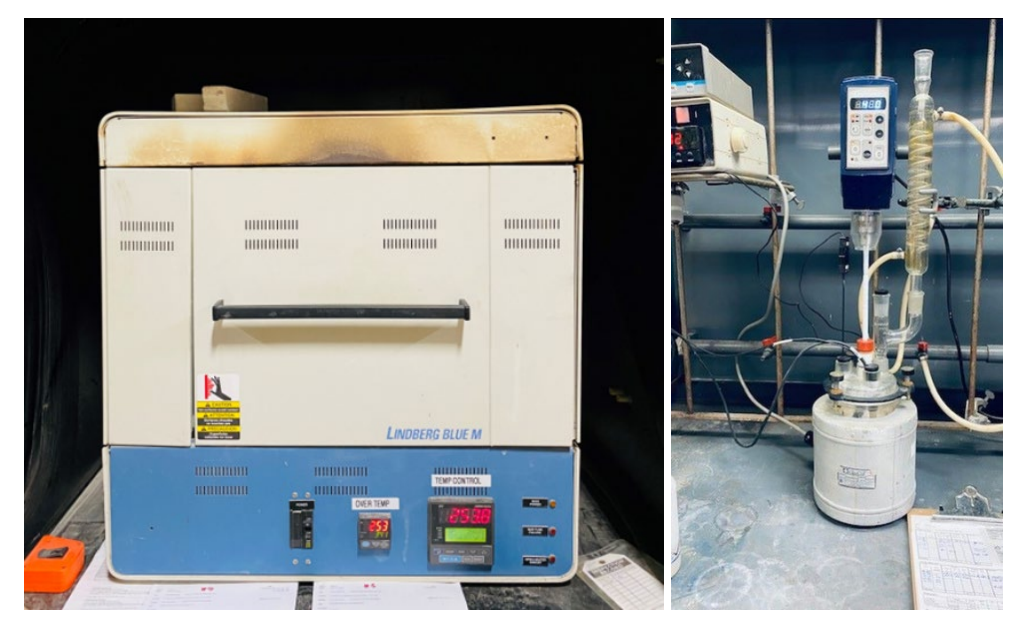
Figure 1: Muffle furnace used for calcination (left) and the water leaching laboratory setup.

Calcined samples were ground to roughly 150 µm. In order to confirm conversion and quantify metal extractions, calcined samples underwent acid mixing followed by roasting in laboratory furnace, at 250°C. The objective of acid mixing and roasting is to convert the lithium in the spodumene to lithium sulphate. Water leaching tests were then completed on the lithium sulphate samples at 60°C for 60 minutes, with results reported in Table 3. The water leaching setup is shown in Figure 1.