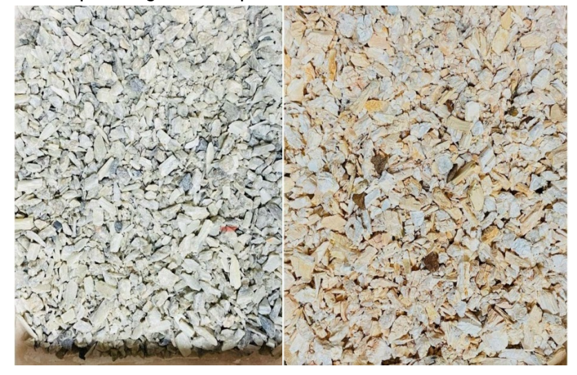
Figure 2 shows an example image of the spodumene concentrate before and after calcination.